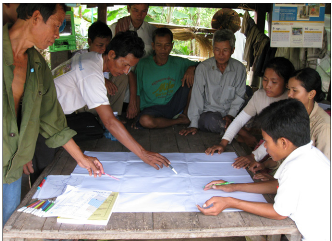
► Supporting community land documentation efforts.

In Cambodia, EWMI supports a diverse portfolio of local NGOs to identify and expand opportunities to engage citizens in local democratic processes. Through