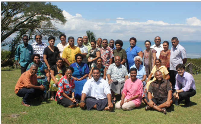
► A meeting of NGO representatives in Fiji, under the Dialogue Fiji Program.