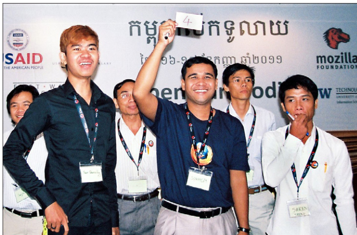
Cambodian youth attend a USAID-Mozilla Foundation forum created by EWMI to expand the reach and enhance the security of the award-winning human rights data portal www.sithi.org .

EWMI institutionalized first-ever practical legal skills training programs at Cambodia's largest law faculty and highly successful and well-publicized annual litigation skills competitions, the Client Counseling Competition and the Mock Trial Competition, at two leading law faculties. EWMI also expanded the Alternative Dispute Resolution, Ethics, and Introduction to Advocacy classes it helped develop at the Royal University for Law and Economics (RULE), as well as extending the breadth of the existing English-language program at RULE. EWMI fostered a new generation of young women lawyers through a scholarship program for women from the provinces, which has been continued by the Raoul Wallenberg Institute of Human Rights and Humanitarian Law. Additionally, EWMI spearheaded the creation of the first academic law journal in Cambodia, the production of the first Khmer-English ADR book and the first publication of the Annotated Cambodian Code of Criminal Procedure.