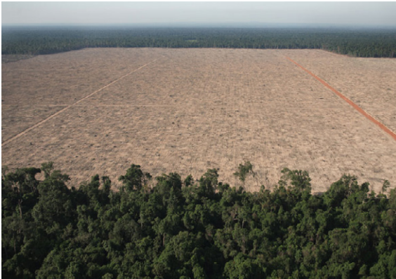
► Deforestation in Cambodia

EWMI's environment program is designed to work with local citizens to find sustainable and community-based solutions to urban and natural environmental conservation issues. In 2019, EWMI launched a new special initiative, Green Equity Asia, that works at the intersection of natural resources conservation, and community empowerment in the dynamic growth economies of Asia. Our initial priority is the Lower Mekong sub-region, a region of breathtaking biodiversity, conservation innovation, and mounting investment. EWMI's Open Development Initiative has also published and made available Environmental Impact Assessments (EIA) documentations across the ODM platform and these documents allow users to access information about investment projects being developed.