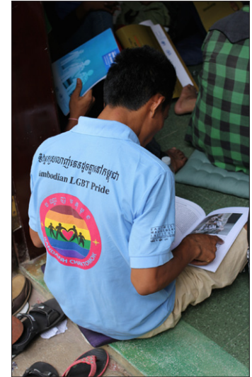
► A participant at a multi-day workshop to celebrate the International Day Against Homophobia and Transphobia (IDAHOT).

The East-West Management Institute, Inc. qualifies as a tax-exempt public charity under Section 501(c)(3) of the US Internal Revenue Code as amended.