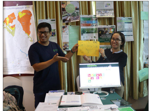
► The Cambodian Center for Human Rights used open source data on economic land concessions from Open Development Cambodia to support a report investigating land-related rights violations.

Since the expansion of the ODI networks across the region and an increased focus upon data governance, data privacy and digital rights it was apparent that the international and regional focus on the protection of personal data and privacy rights is inadequate for Indigenous People. Additionally, the representation of Indigenous data is hugely problematic, with many national level statistics under-representing, misrepresenting or not taking into consideration Indigenous data rights. There is an urgent need for the development and implementation of collective Indigenous privacy laws, regulations and standards. The ODI has collaborated with stakeholders across the region including partnerships with the Asian Indigenous Peoples Pact (AIPP) and other national Indigenous groups to promote and disseminate the best practices of implementing Indigenous Data Sovereignty (IDS) to ensure that Indigenous Peoples have agency over their data and the ability then to dictate the narratives about their communities. IDS is vested in a data governance and management approach that puts people in control of their own data. The global framework is outlined in the CARE principles which we have been supporting translation and dissemination of. The ODI team has also contributed to the best practices standards for RDA COVID-19 Guidelines for Data Sharing Respecting Indigenous Data Sovereignty.