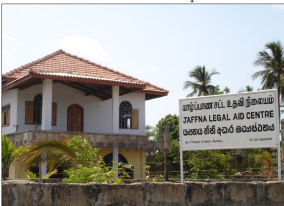
► Jaffna Legal Aid Centre

EWMI understands that a justice system is not just if it is beyond the reach of the poor and the vulnerable. An important part of EWMI’s mission is to help expand the breadth and quality of legal aid and develop innovative public awareness campaigns so that people understand their rights and how to exercise them. In Cambodia, through a legal defense fund, EWMI’s legal aid partner represents constitutional rights defenders, including those charged with incitement, sometimes based on social media or private comments about COVID-19. EWMI helped produce a television series designed to educate Cambodians about their legal system at work, and provided extensive support to CSOs providing legal aid for the indigent. Additionally, EWMI facilitated the first “Legal Aid Leadership Forum,” which provided a venue for the leaders of legal aid service providers to discuss common issues and problems. In